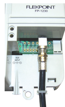
Coax F-Style Interface